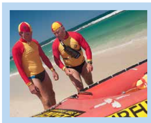
PHOTO: Always swim between the red and yellow flags at the beach

Do not swim alone, or at night, when no-one can see you. The ocean can be a dangerous place.