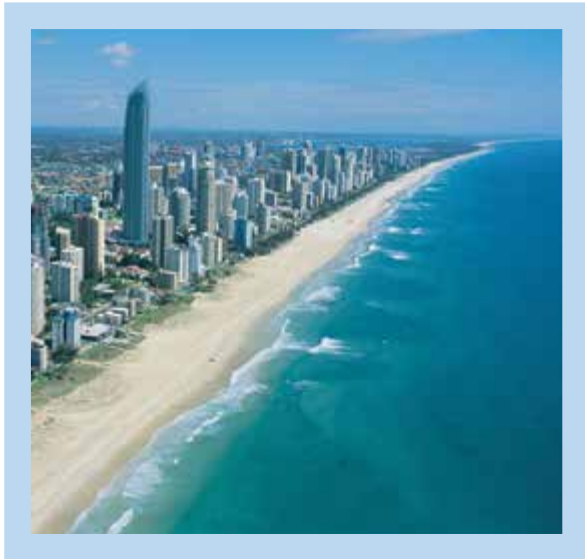
PHOTO: Surfers Paradise on the Gold Coast